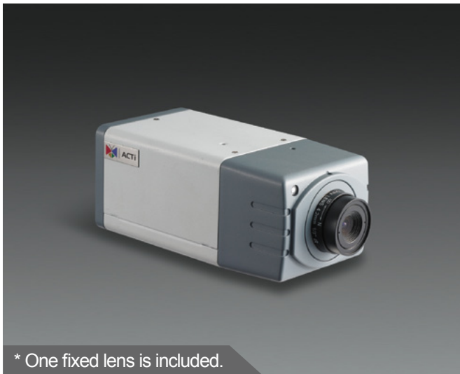
* One fixed lens is included.